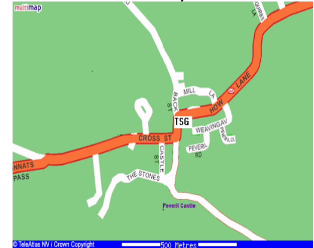
The TSG hut can be found in the heart of the Peak District

The Chapel is on the A625, in the middle of Castleton. Approaching from the East, the road passes The Peak Hotel on the left shortly after entering Castleton, and then goes round a sharp left-handed corner. The Chapel is then on the right, immediately before the road turns equally sharply to the right. Approaching from the West, descend Winnats Pass into Castleton, and go straight on at the poached-egg roundabout. Shortly after passing The Castle, which is to the right, the road swings sharply to the left. The Chapel is on the left immediately after this corner.